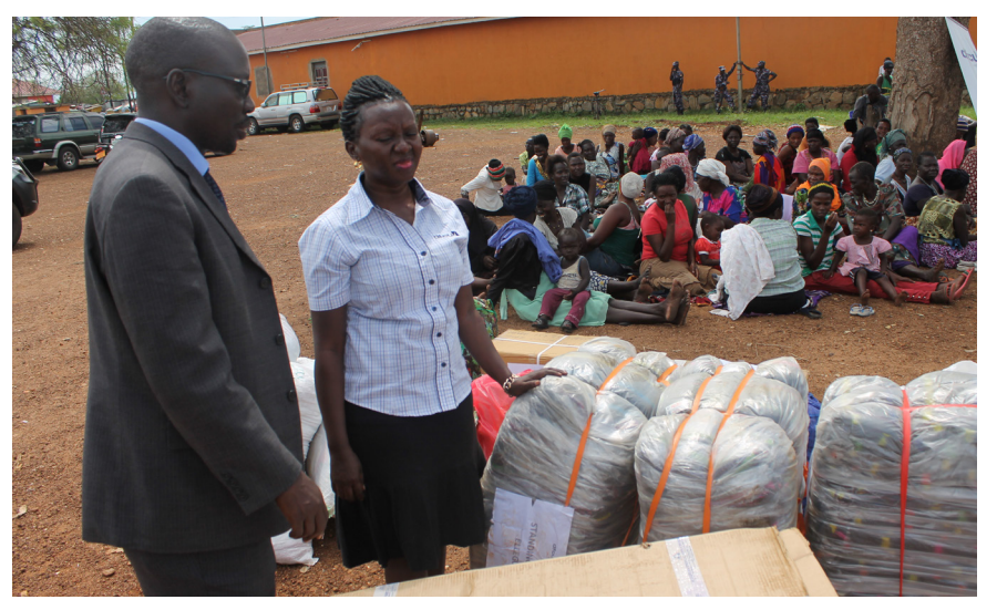
▲ Supported communities in Northern Uganda

We continue to demonstrate a firm commitment towards the communities in which we operate by identifying and supporting causes that will facilitate the upliftment and betterment of the society. Our Corporate Social Investment (CSI) initiatives are influenced by our CSI Pillars. These are; community development, maternal and child health, emergency interventions, financial inclusion, agriculture and rural development which are areas that affect the foundation of our communities.