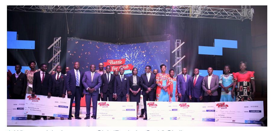
Winners of the Investment Club 'Battle for Cash" Challenge