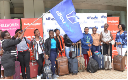
training session in Lira, Northen Uganda, as program are flagged off to Nairobi for a part of the WiB Rising Woman program.