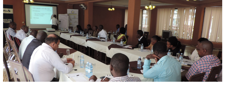
Business training workshop for SMEs during the Top 100 initiative

Small & Medium Enterprises (SMEs) are the engine for economic growth. Our sponsorship of the Top 100 Medium Sized Company Survey (SME Top 100) for the last two years is a platform for dfcu to provide opportunities for SMEs to create value and build sustainable businesses.